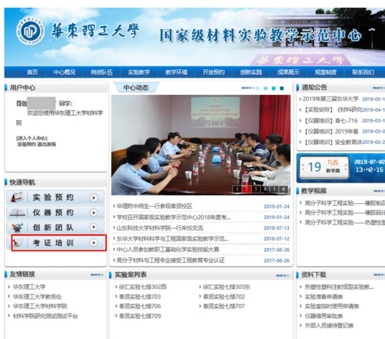
图 2-1 首页_考证培训

点击左边“考证培训”（见图 2-1），出现图 2-2，选择你要报名的培训项目，点击该项目右侧的“报名”，出现图 2-3，“选择导师”中选择你的导师，并填写自己的邮箱和手机号，点击“报名”，报名成功以后，会跳出对话框，如图 2-4，显示：报名成功，邮件通知已经发送给导师，请等待导师审核。导师审核后，报名方可成功。