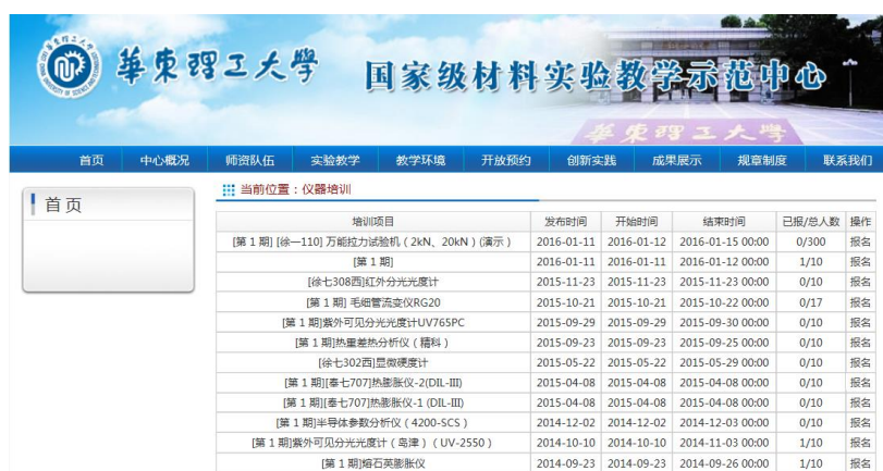
图 2-2 考证培训