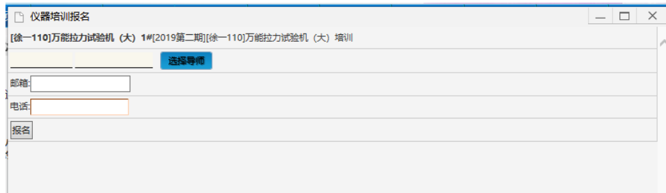
图 2-3 报名提交